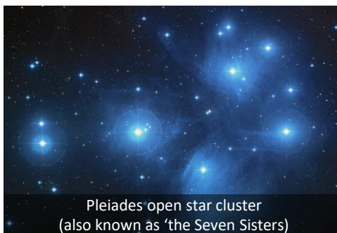
Pleiades open star cluster (also known as 'the Seven Sisters')

Venus continues to dominate the western sky throughout April and will be very close to the open cluster of the Pleiades from 1st to 5th of the month with the best view being on 2 April. Through binoculars this will be a fantastic sight with the many stars of the cluster, and you should be able to see that Venus is a crescent. It is interesting to know that the Pleiades is 400 light-years away, so we are seeing the cluster as it was in the year 1620*. Venus on the other hand is only 6 light-minutes away!