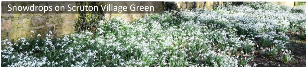
Snowdrops on Scruton Village Green

Winter has been very mild and wet, resulting in large pools of water in fields attracting Little Egrets. Up to four have regularly been seen in the Parklands and the fields in front of the Coore Arms. Ten years ago this would have been a very rare sight! Already spring flowers are to be seen on the village green; snow drops and aconites are plentiful, and will be closely followed by daffodils and crocuses. The rooks have started to sit in pairs in the lime trees, trying to establish their nesting sites, resulting in considerable squabbling and cawing. On one of the lime trees beside the lychgate, a great spotted woodpecker (shown in photo) is using a hollow branch as a sounding board, which can clearly be heard over a considerable distance!! Song birds, especially thrushes and robins, are beginning to sing as the days grow longer.