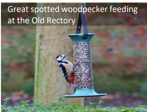
Great spotted woodpecker feeding at the Old Rectory