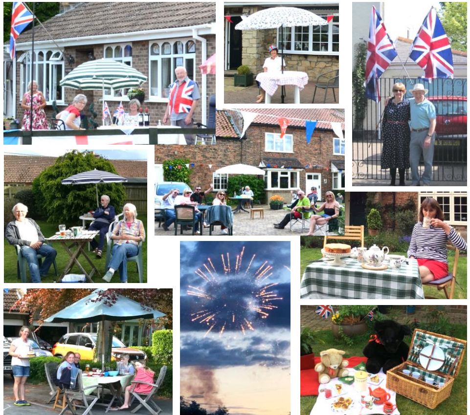
Thank you to everyone who sent pictures of their 'Stay-at-Home' street party on VE Day and apologies for those the editor didn't have space to include.