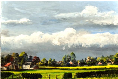
Scruton from the south west (2017)

I am currently looking out for old black and white photographs of working horses so that I can produce coloured paintings from them.