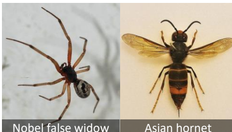
Nobel false widow

Rewilding is all the rage at the moment. However it may come as a surprise that there are over 2,000 non-native species of plants & animals already established in the UK. Many have been deliberately introduced, but a significant number have arrived accidentally. Examples in our neighbourhood include Himalayan balsam, Japanese knot-weed, giant hogweed, mink, signal crayfish and ring neck parakeets. Some of these alien species can be disruptive and cause problems to indigenous species.