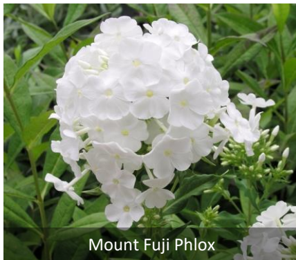
Mount Fuji Phlox

Most lavenders such as Hidcote and Munstead have finished flowering, although the taller Latifolia is still in bloom. Give them a good trim, but not down to the woody stem. I leave a few stems to set seed for sowing next year as the plants can become untidy after a few years, and I replace them with my own young plants.